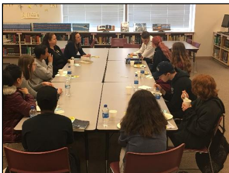
A number of students participated in this year's Battle of Books, reading several books together over the course of the year. One of the perks: periodic lunch & book discussion with the librarian.