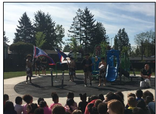
Our Pacific Islander Club participated in several multicultural activities during the year. Here they are performing for students at the FPS Hewins Early Learning Center.